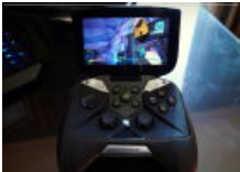
The biggest news from CES so far