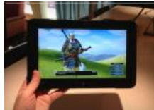
Razer Edge brings full PC gaming to a versatile tablet (pictures) Slideshow