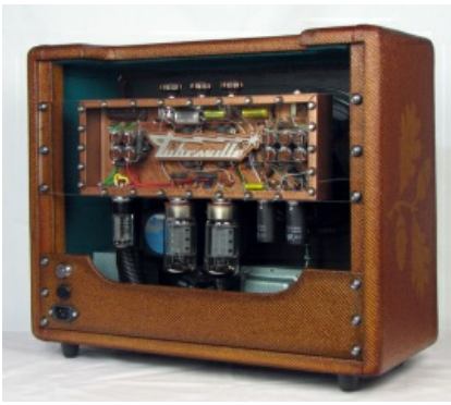
The Grand Champion guitar amp, shown from the rear.