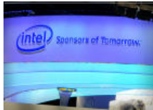
Voice recognition will make touch obsolete, Intel exec says