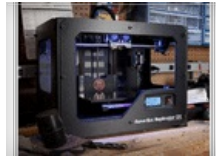
MakerBot Replicator 2X 3D printer gets the spotlight Review