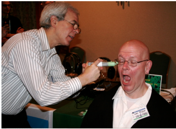
I'm not screaming—the audiologist told me to keep my mouth open while the goo set.